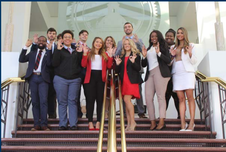
Members of FAU Student Government at the Capitol Building