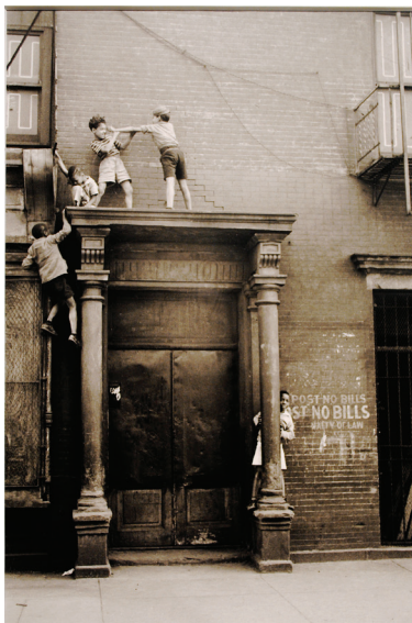
Helen Levitt New York , 1942 Gelatin silver print Martin Z. Margulies Collection