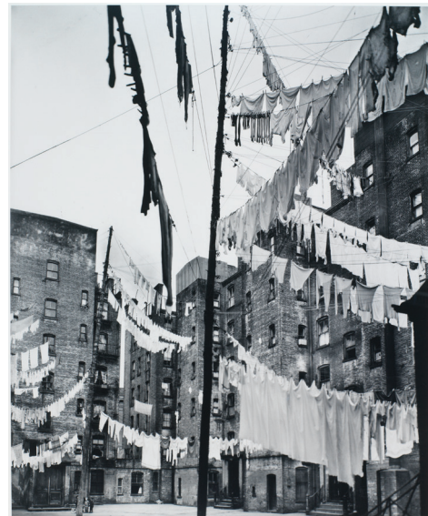
Berenice Abbott Court of the First Model Tenement in New York City 1325-1343, 1936 / print 1979 Gelatin silver print