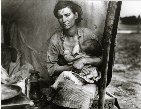
Dorothea Lange From the Migrant Mother Sequence , Image #3, 1936 Gelatin silver print Martin Z. Margulies Collection