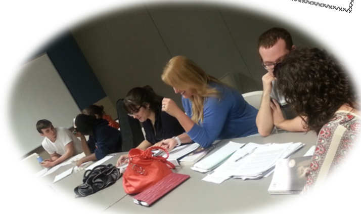
STUDENTS IN THE HONORS SEMINAR