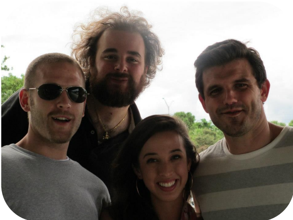
EGSS Annual Picnic