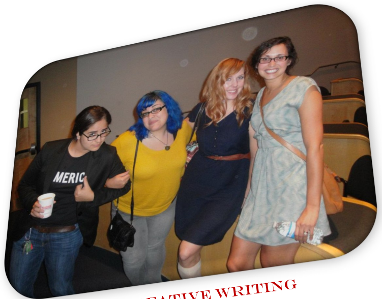
NIGHT OF CREATIVE WRITING