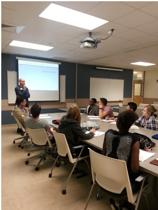
English Club Resume Writing Workshop

The English Club is making waves since we launched in 2012. Last year, club members took part in community service by having clothing drives for the Salvation Army, and successful food drives for Palm Beach and Treasure Coast