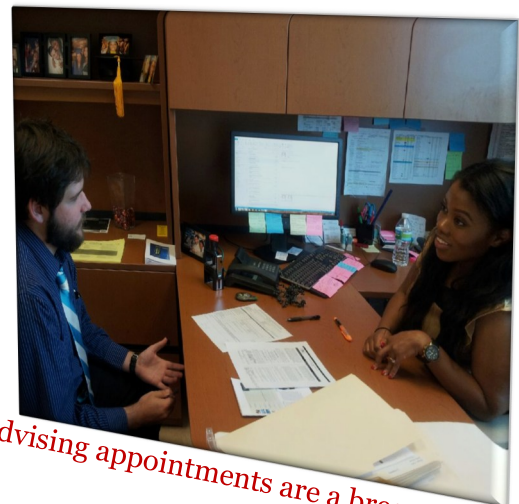
Advising appointments are a breeze