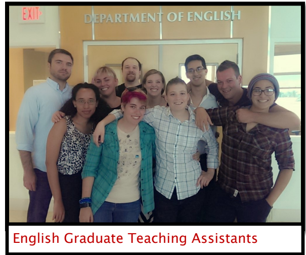
English Graduate Teaching Assistants