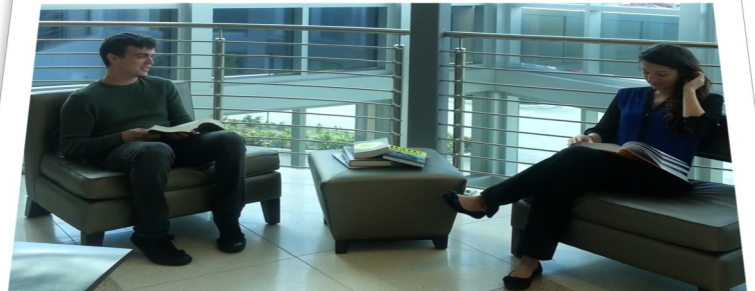
ENGLISH MAJORS CATCHING UP ON SOME READING