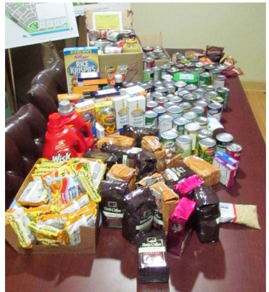
English Club Jupiter campus food drive for Treasure Coast Food Bank

This year will be just as exciting as the last! Please visit our website to find out more information about our club: www.fau.edu/english/english_club.php